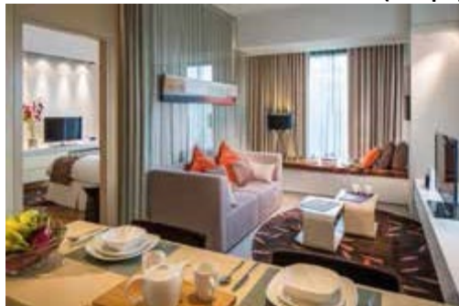
1 Bedroom Suite (40sqm)